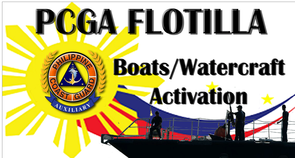
Banner for Boat / Watercraft Activation Registration for Coastal Community Auxiliary Division (CCAD)